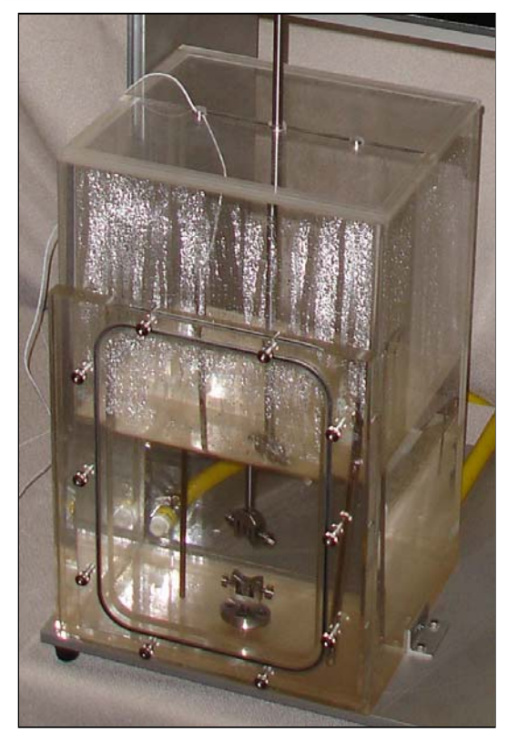
Creep Test System

Tall bath for high extension creep test of polymer based tubes - medical device manufacturer – sample is submerged in 37C saline.