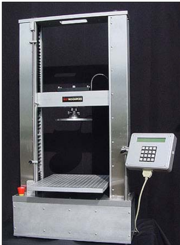
Dual Column 2000M Universal Test Frame with IFD fixtures