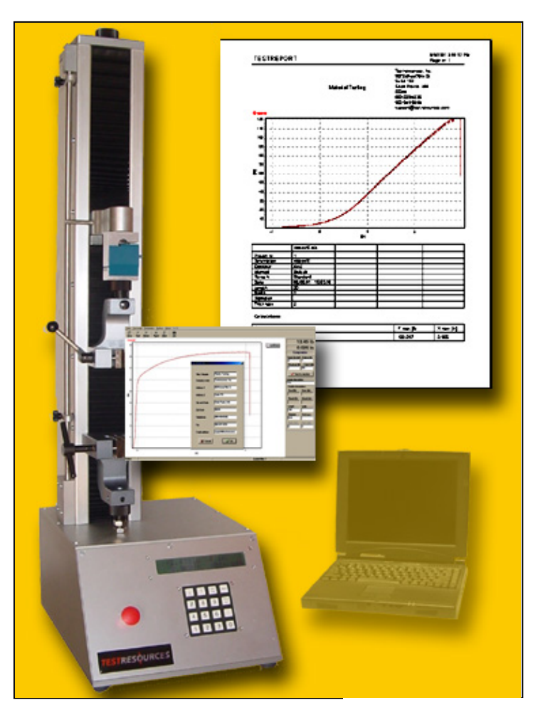
1000M Test System – see 650M , 200Q and 100P Series